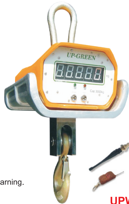
UPW-3000H Heat Prevent Crane Scale