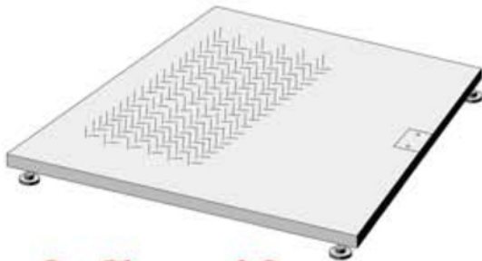
C - Channel Structure