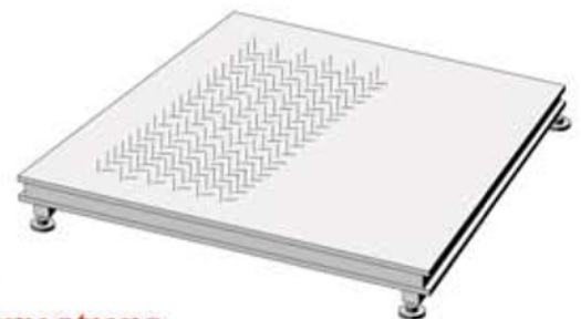
I - Beam Structure