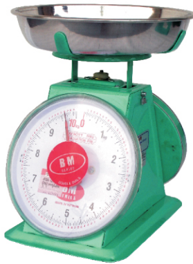
MD-210 (10 kg x 50 g)