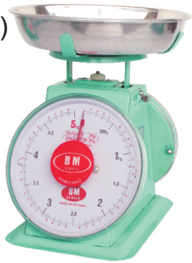
MD-205(B) (5 kg x 20 g)