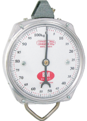
MH-100 (100 kg x 500 g)