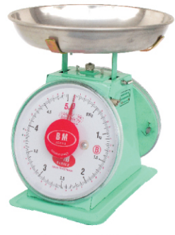
MD-205 (5 kg x 20 g)