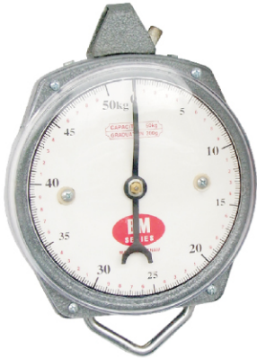
MH-50 (50 kg x 200 g)