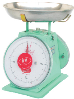
MD-202 (2 kg x 10 g)