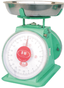
MD-220 (R) (20 kg x 100g)