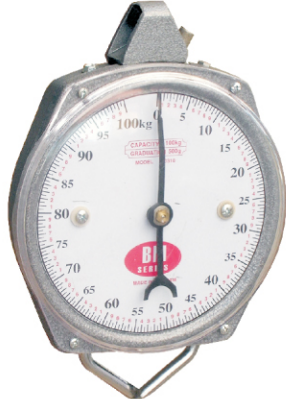
MH-100(S) (100 kg x 500 g)