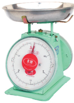
MD-203 (3 kg x 10 g)